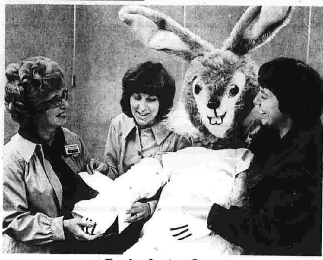
Tender Loving Care